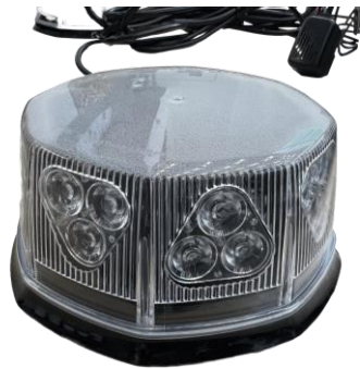
Figure 6. LED