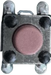
Figure 3. Test Button