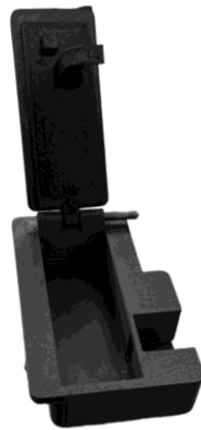
Figure 4. Key Box