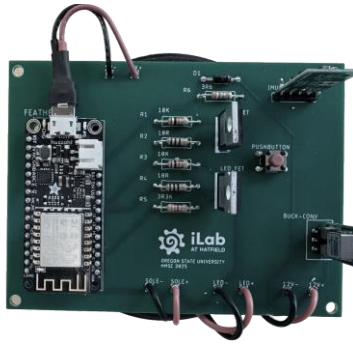
Figure 5. Logic Board