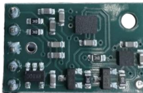
Figure 7. IMU Accelerometer