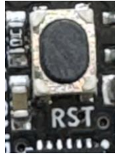
Figure 4. RST Button